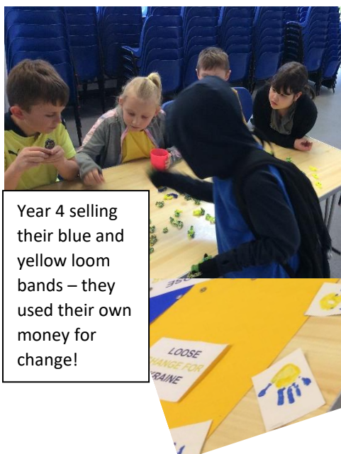
Year 4 selling their blue and yellow loom bands – they used their own money for change!

Our Help for our Help for Ukrainian Children - support for Peace Day was an overwhelming success and thanks to everyone's generosity we raised an incredible £405! The money will be sent off to Save the Children and will fund much needed 'School in a bag' for several Ukrainian refugees. It really was lovely to see so many parents and carers come together for such a worthy cause. The cakes were delicious - a massive thank you to all the staff who made them.