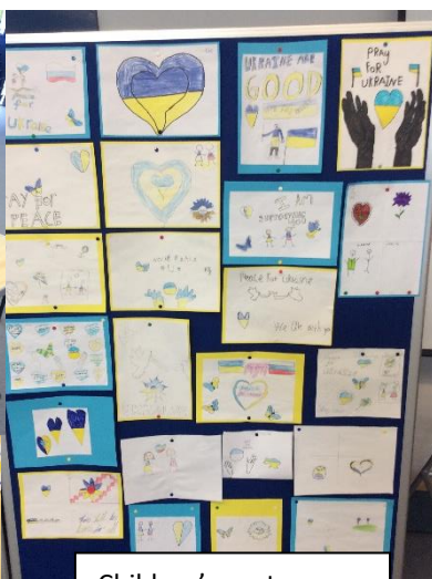
Children's posters supporting peace.