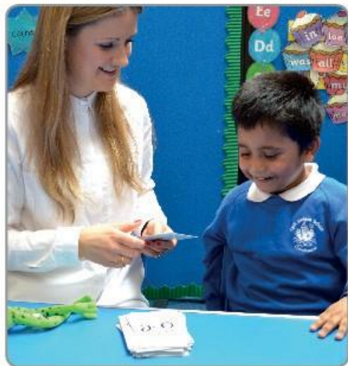
Learning the Speed Sounds in the classroom.